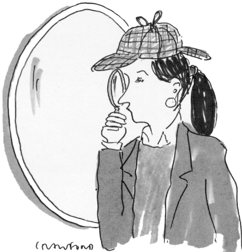
The professional who reasons productively casts a critical eye on her own role in a company's problem.

First, the consultants would have demonstrated their commitment to continuous improvement by being willing to examine their own role in the difficulties that arose during the consulting project. No doubt they would have identified their managers and the clients as part of the problem, but they would have gone on to admit that they had contributed to it as well. More important, they would have agreed with the manager that as they explored the various roles of clients, managers, and professionals, they would make sure to test any evaluations or attributions they might make against the data. Each individual